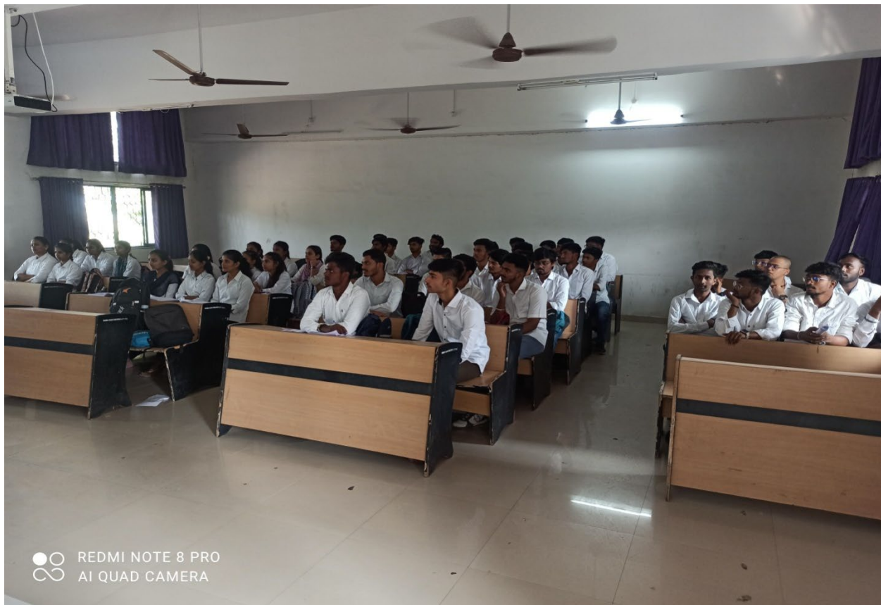
Fig: B.Tech Students of Mechanical Engineering Department.