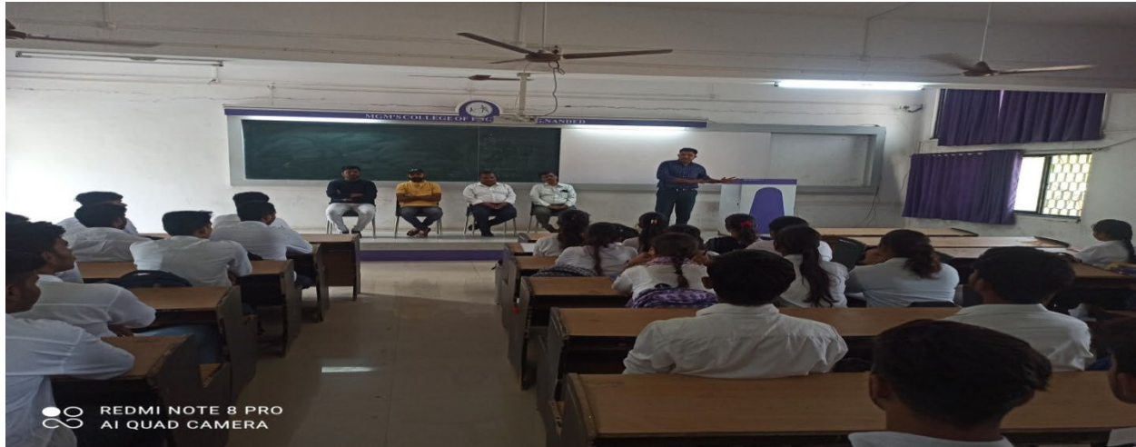
Fig: Mr.Titare addressing students about SSC Exam .