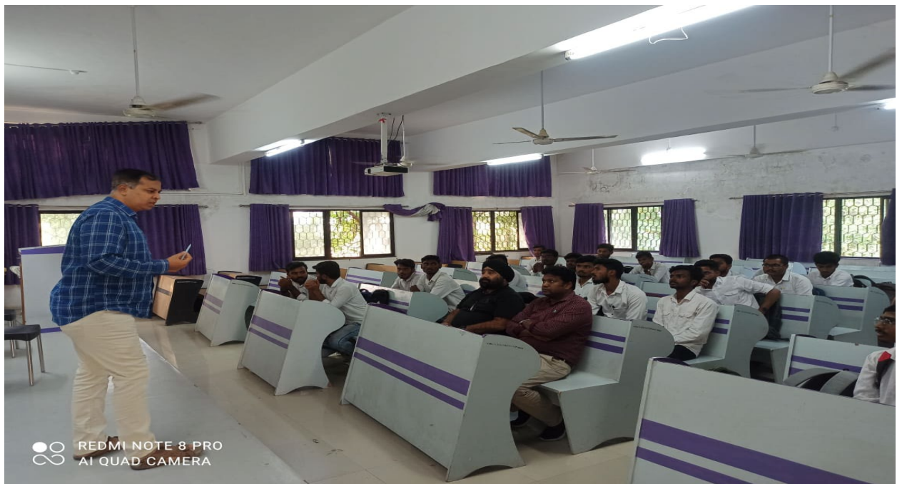
Fig: Expert Lecture was for B.Tech final year students .