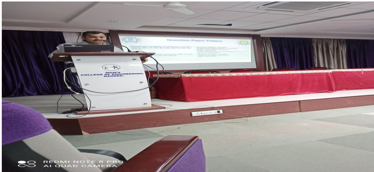
Fig: Expert lecture about GATE Benefits in Engineering.